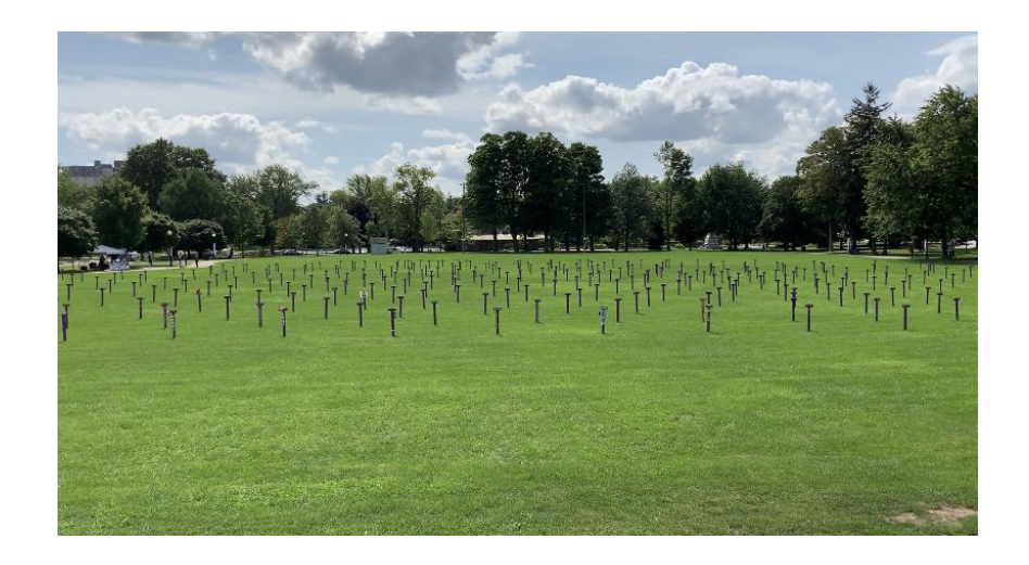
Photo: Waterloo Region Overdose Awareness Day 2021, Kitchener, Ontario

that the Issues of Substance report be presented to Region of Waterloo Council, and shared with all orders of government; including local MPs, MPPs, and all relevant federal and provincial Ministers, as well as with related stakeholders.