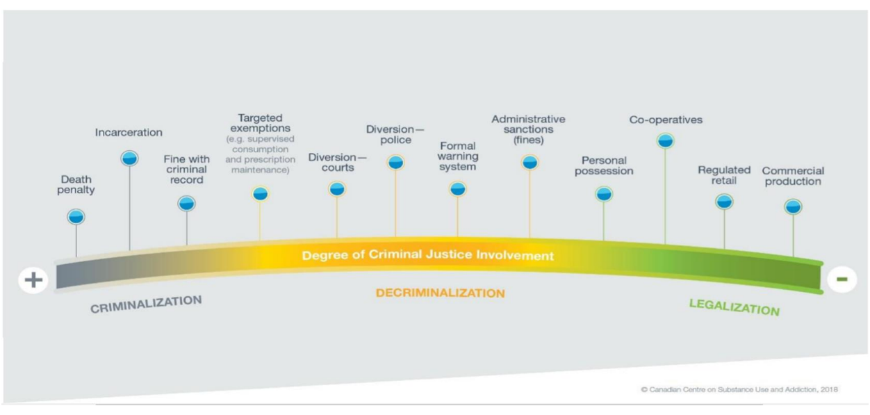
Figure 1: The Regulatory Continuum

of select mandatory minimums, amendments to the CDSA) and a private members bill, C-216<sup>13</sup> ( An Act to amend the Controlled Drugs and Substances Act and to enact the Expungement of Certain Drug-related Convictions Act and the National Strategy on Substance Use Act). These are among the opportunities currently before Members of Parliament.